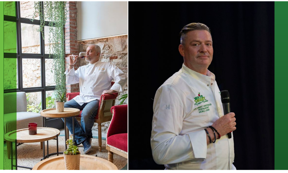
Chef Xavier Pellicer , Restaurant Xavier Pellicer (Spanje)

A "Plant-based Untouchable" chef is an example for all chefs and vegetable lovers around the world. The title is only bestowed on chefs who have made it into the We're Smart® Top 100 list at least twice in their career. They are then inducted into the We're Smart® Elders which plays an advisory role within We're Smart® World. An Untouchable is no longer listed in the Top 100 list but is bestowed an honorary place that is hors categorie.